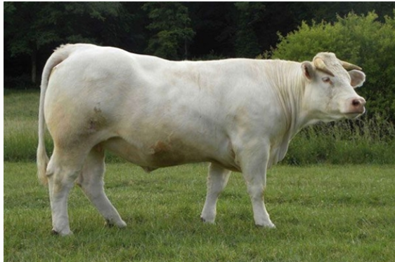
Epinette, daughter of ARTOIS - ENSAIA (Fr)