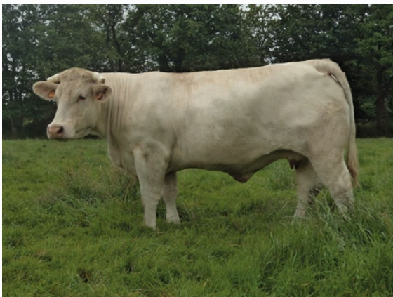
7371, daughter of EPERNAY - GAEC LE PATIO (85)