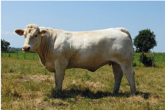
Daughter of EPERNAY